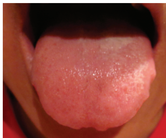
Figure 2. Fat swollen tongue with thin white coatings and teeth marks on the side, signifying weakness of spleen with excess of water and moisture.

diseases, hence the coverage of these areas in the history taking. Arguably, this could be interpreted as the earliest model of history taking as taught today in Western medicine.