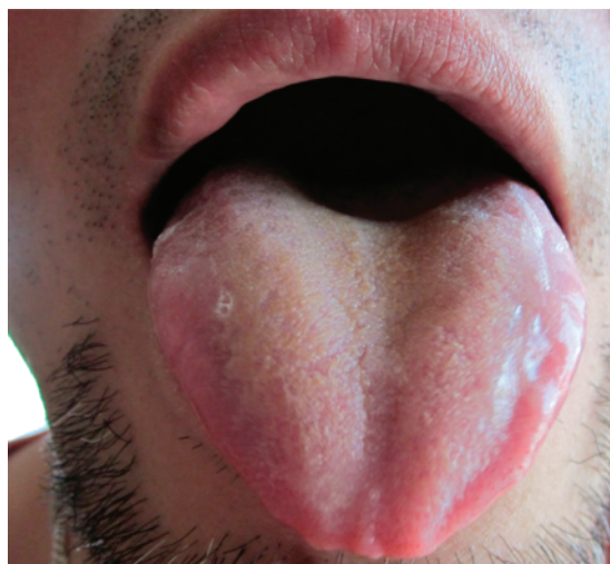
Figure 3. Tongue with normal body but yellow coating, signifying excess of moisture and heat.