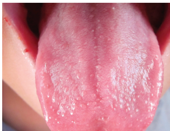
Figure 5. Tongue of an 8-year-old male with normal looking body but lack of tongue coating, signifying weakness of stomach. He has low appetite for food.