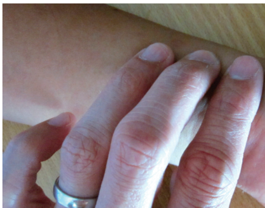
Figure 6. Taking the pulse in the TCM manner. Note the standard positioning of the index, middle and ring fingers of the TCM practitioner over the radial artery of the patient in that order.

TCM practitioners place three fingers (index, middle and ring) along the radial artery of the patient to feel for the intensity, rate, rhythm, wave characteristic and resilience of the pulse (See Fig. 6). Up to 28 types of pulses have been described in the ancient archives of TCM like the Su Wen of the Yellow Emperor's Internal Classic in 260 BC (Lu, 1985) and the Mai Jing (脉经) in 280 AD (Zheng, 2002). Despite fewer pulses being recognized in most day-to-day practice, taking the patient's pulse is considered a mandatory diagnostic step, together with tongue inspection. There have been attempts to scientifically analyse the dynamic behind the various pulses but so far they have not been successful. An editorial regarding the evaluation of conduit artery function mentions some similarities with the TCM pulse diagnosis but they are hardly comparable (Oparil and Izzo, 2006). Pulse taking remains a diagnostic skill that has to be acquired through good apprenticeship and is refined during years of clinical practice.