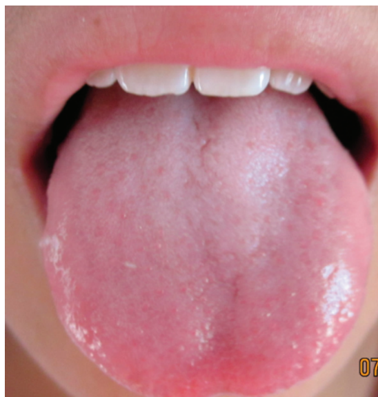
Figure 4. Tongue from a 13-year-old male with redness at tips and prominent taste buds, signifying heat of the heart meridian (this child has mild insomnia).